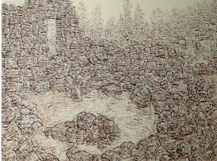
Landscapes of Desire.