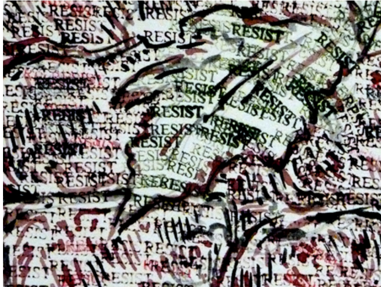
Landscapes of Desire