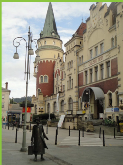
VENUE OF THE CONFERENCE: Celjski dom, Krekov trg 3, Celje

COLLECTING AND COLLECTIONS IN TIMES OF WAR OR POLITICAL AND SOCIAL CHANGE Celje, Slovenia, 3–6 December 2014