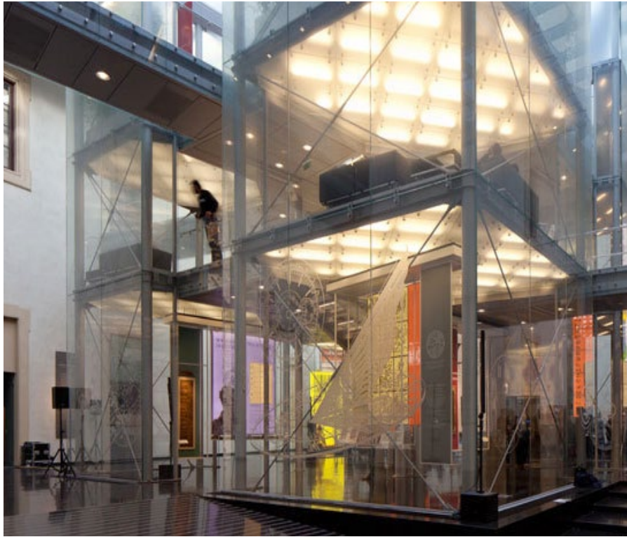
Photo: Palazzo Pepoli Vecchio, Bologna