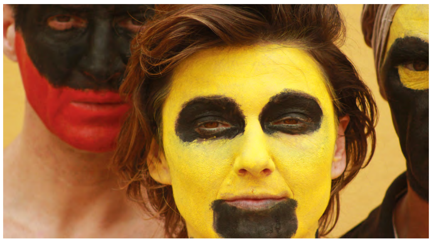
An excerpt from the dissemination of "Impressions d'Afrique", the MK performance organised by Routes Agency in cooperation with the MeLa Project at Museo "Luigi Pigorini" in Rome. The MK performance organised by Routes Agency in cooperation with the MeLa Project at Museo "Luigi Pigorini" in Rome. The MK performance organised by Routes Agency in Cooperation with the MeLa Project at Museo "Luigi Pigorini" in Rome. The MK performance organised by Routes Agency in Cooperation with the MeLa Project at Museo "Luigi Pigorini" in Rome. The MK performance organised by Routes Agency in Cooperation with the MeLa Project at Museo "Luigi Pigorini" in Rome. The MK performance organised by Routes Agency in Cooperation with the MeLa Project at Museo "Luigi Pigorini" in Rome. The MK performance organised by Routes Agency in Cooperation with the MeLa Project at Museo "Luigi Pigorini" in Rome. The MK performance organised by Routes Agency in Cooperation with the MeLa Project at Museo "Luigi Pigorini" in Rome. The MK performance organised by Routes Agency in Cooperation with the MeLa Project at Museo "Luigi Pigorini" in Rome. The MK performance organised by Routes Agency in Cooperation with the MeLa Project at Museo "Luigi Pigorini" in Rome. The MK performance organised by Routes Agency in Cooperation with the MeLa Project at Museo "Luigi Pigorini" in Rome. The MK performance organised by Routes Agency in Cooperation with the MK performance organised by Routes Agency in Cooperation with the MK performance organised by Routes Agency in Cooperation with the MK performance organised by Routes Agency in Cooperation with the MK performance organised by Routes Agency in Cooperation with the MK performance organised by Routes Agency in Cooperation with the MK performance organised by Routes Agency in Cooperation with the MK performance organised by Routes Agency in Cooperation with the MK performance organised by Routes Agency in Cooperation with the MK performance organised by Routes Agency in Cooperation with the MK performance organ

→ Reporting about the latest MeLa Design Actions → Presenting the RIME final conference outcomes → Introducing the new MeLa Books → Illustrating the programme of the forthcoming MeLa Seminar in Paris