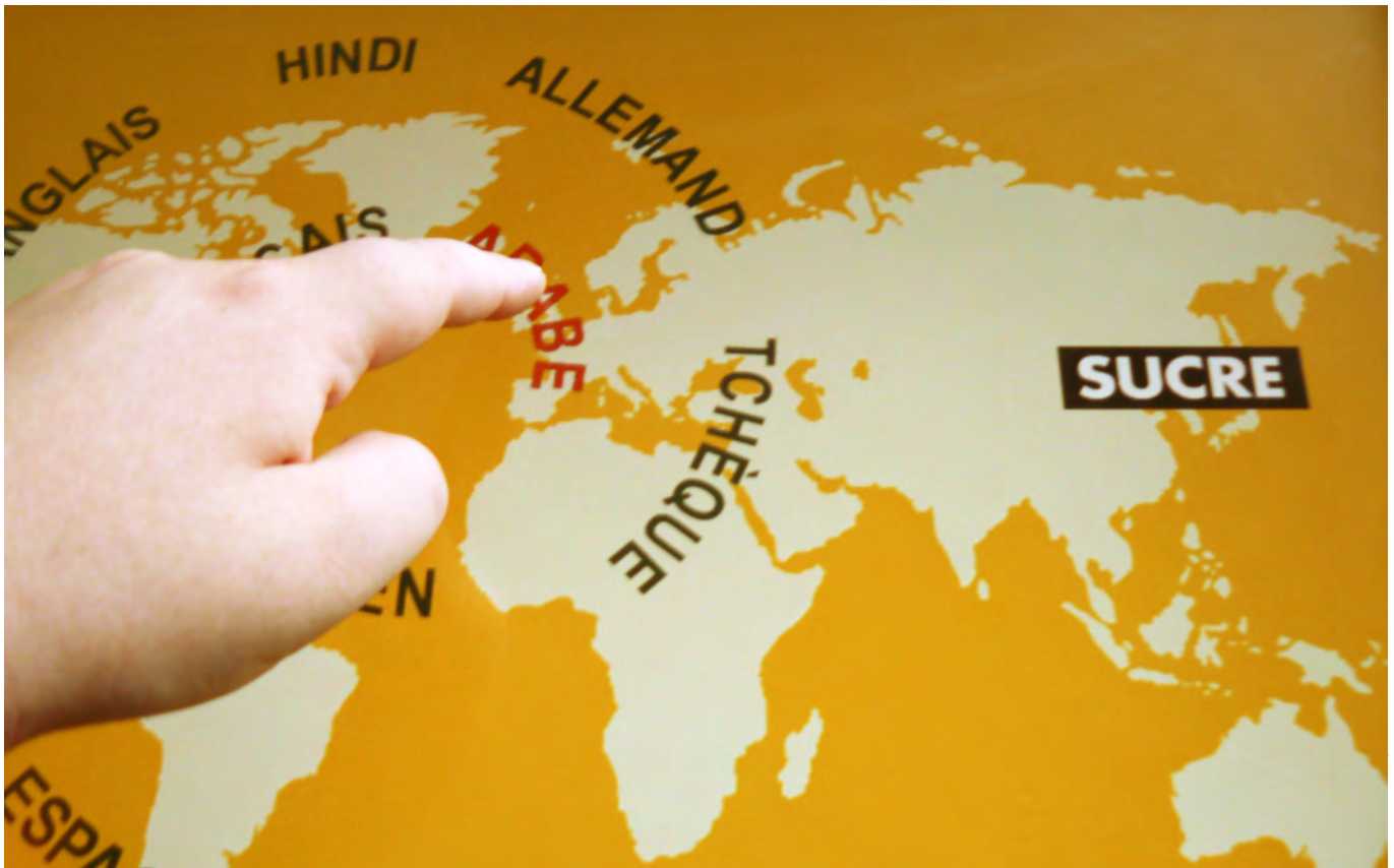
A snapshot of the digital tool "Les mots migrants" at the Cité Nationale de l'Histoire de l'Immigration.

→ Introducing the MeLa Experimental Action at the Diocesan Museum in Milan → Reporting the outcomes of the LEM final event and other MeLa related conferences → Providing some insights on the MeLa Seminar in Paris