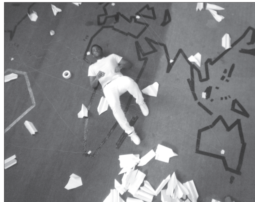
Quinsy Gario, A Village Called Gario , 2014 © Quinsy Gario

Zwarte Piet is Racisme (Black Pete is Racism) and A Village Called Gario are two performance projects by Quinsy Gario. For both projects, Gario took specific locations as points of departure. The Zwarte Piet is Racisme problematises the figure of Zwarte Piet (Black Pete) that returns to the Netherlands every year in November, during the Saint Nicholas feast. Aspects of this performance project are shown in photographs, while for A Village Called Gario which will actually be staged at MACBA the artist takes a village called Gario in the Central Republic of Africa as the starting point for an imaginary trip. During this trip he traces possible ways of how his family ended up in the Caribbean with that last name. While touching upon the ways in which those places now negate their colonial and postcolonial heritage.