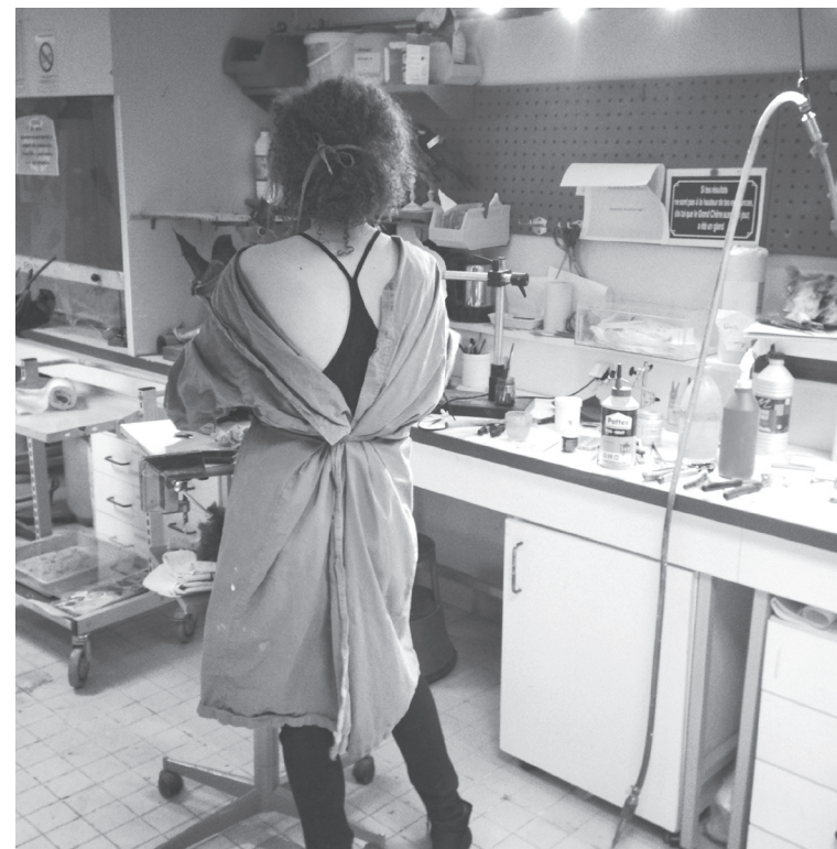
Research pictures from the taxidermy laboratory of the Natural History Museum, Paris, 2014