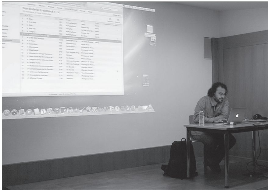
Kader Attia, Lecture-performance, 1 May 2014, Whitechapel Gallery, London.